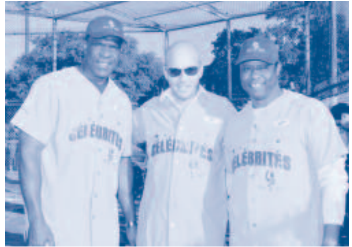
André Dawson, Martin Matte, Warren Cromartie