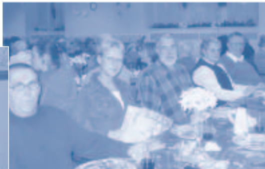
What a fantastic meal ! Thanks Au Vieux Duluth!