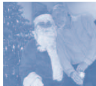
Santa was busy all night!