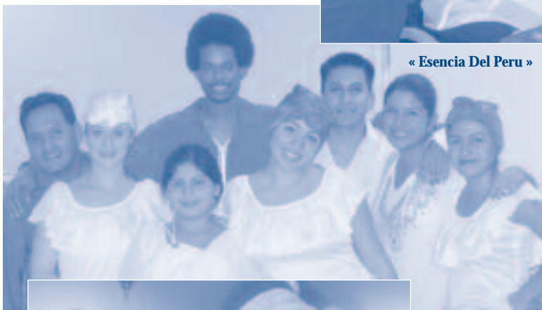
« Esencia Del Peru »