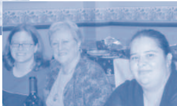
Our volunteers helped make this night memorable